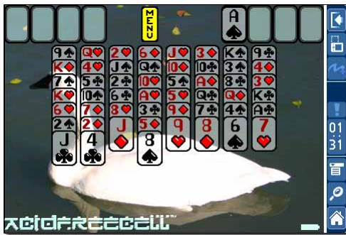
Swan background with much blending.

OS5+ Denotes Palm OS 5 or higher is required.